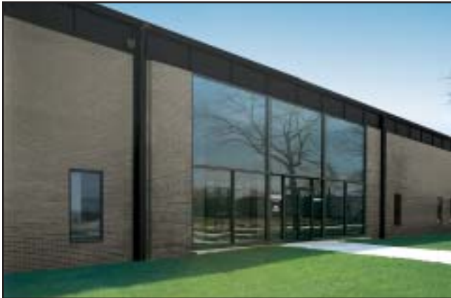
IMC Headquarters Wheeling, Illinois USA

Industrial Motion Control, LLC (IMC) , headquartered in Wheeling, IL USA, is a leading manufacturer of precision cam-actuated index drives, parts handlers, in-line conveyors and custom cams.