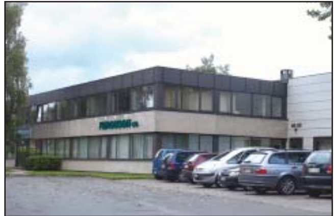
European Headquarters (Ferguson S.A.) Braine-le-Château, Belgium

Formed by the merger of Commercial Cam Co. and Ferguson Machine Co., IMC offers the widest range of products in the industry. With over 100 years of experience and significant investments in personnel and